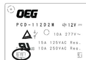
Production Code year+month